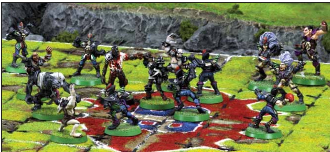
The Dark Elf potty-helmet joke didn't go down very well...

For me, this is too big a sacrifice just to have a twelfth man on the squad, and plumping for the Throwers just to get a 'position' player onto your team just isn't what Dark Elves are about – and in any case you could currently start an identical side to this using High Elves for less cash!